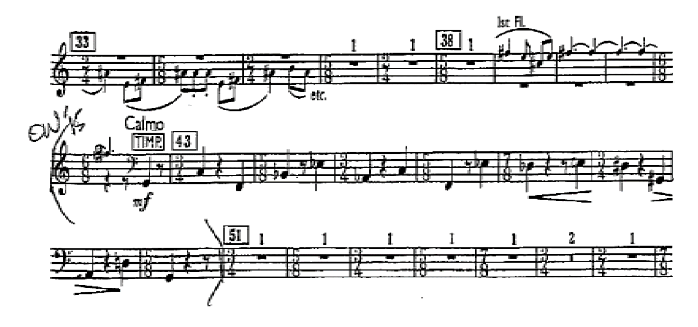
Beethoven, Symphony No. 7, Mvmt. I (mm. 89-110)