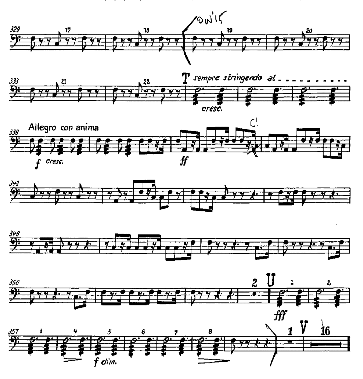
Wagner, Funeral March from Gotterdammerung, (Beginning 3 mm - Timp II solo)